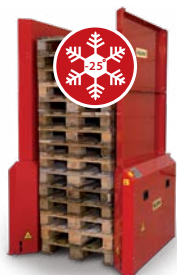
Pallet handling in cold environments down to -25 C° / -13 F° (Only for AC models)