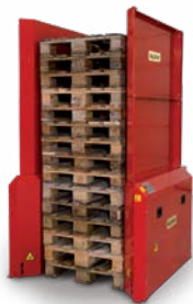
Safety frame for 15 pallets