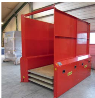
Custom-made for 2400x1200x160 mm platforms