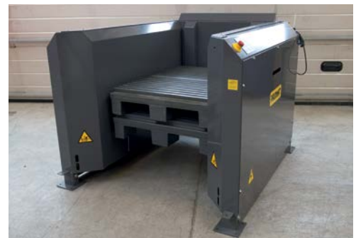
Custom-made for 1060x750x175 mm pallets

Enterprises such as Grundfos, Carlsberg, Coca-Cola, Volvo, Nestlé, Chanel, Haribo, Pfizer, Siemens and Miele have installed PALOMAT® magazines, making their pallet flows more efficient.