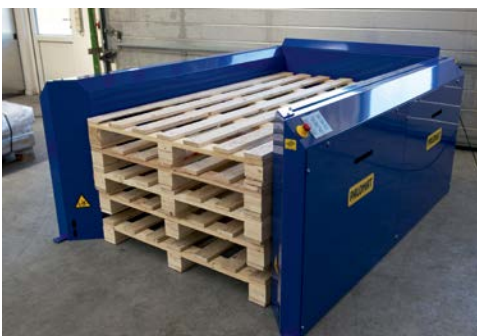
Custom-made for 2015x900x137 mm pallets

Contact your dealer and request a PALOMAT® solution that exactly fits your pallet flow