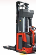
Prepared for AGV