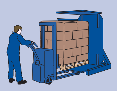
Needs modification for loading by stacker truck